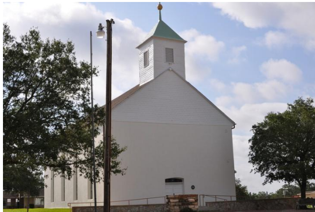
St. Paul's Lutheran Church in Serbin is one of the oldest churches in America in continual use since its construction.

Today, thousands of Texans and other Americans, many unaware of their background, can lay claim to the courageous and fascinating heritage of the Wends.