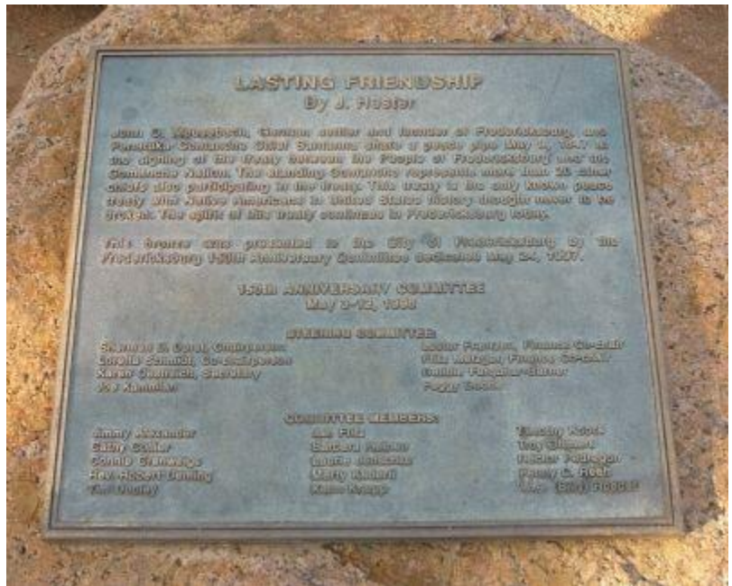
1. Lasting Friendship Marker

This bronze was presented to the City of Fredericksburg by the Fredericksburg 150th Anniversary Committee, dedicated May 24, 1997.